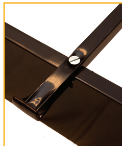
Durable Brown Finish

*Also available for California King beds